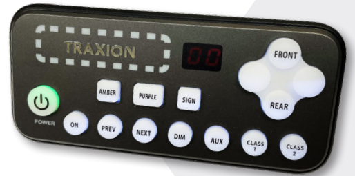
Class I Operation Mode with Sign Lights