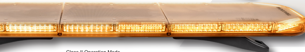
Class II Operation Mode